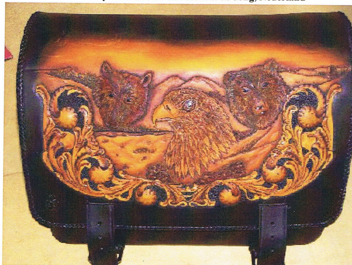
Motobikebag, carved work with wolf, bear and eagle