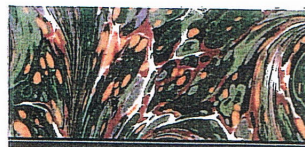
Leathers, Skins and Tools for Artistic Leather Work